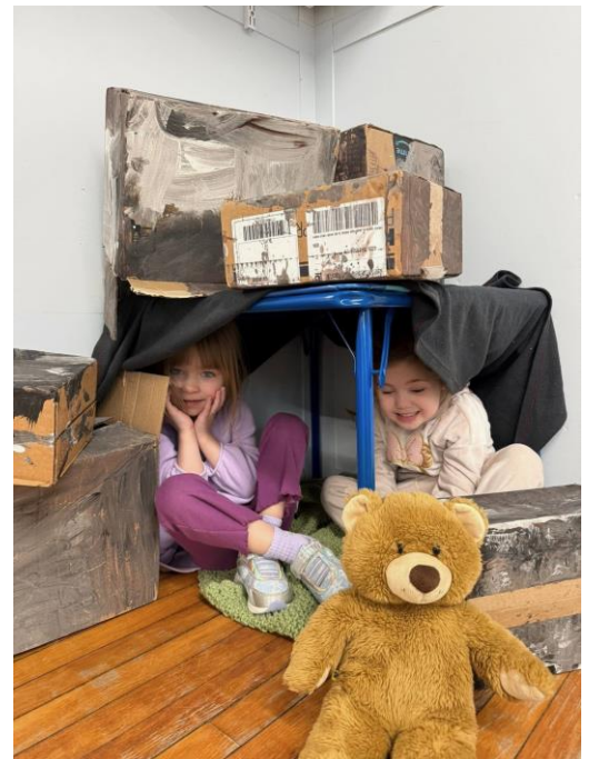
Hibernating with the Bears