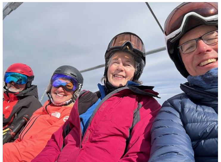
First Congregational Church killing it on the slopes!