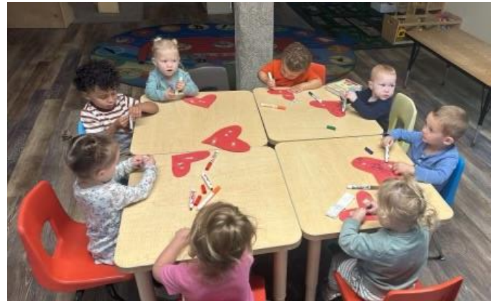
Jesus heals our heart project

Enrollment is up to 23! There are some preschool slots open (infant and toddler rooms are at capacity). Topics for October include apples, acorns, sunflowers, pinecones, pumpkins and of course Halloween!