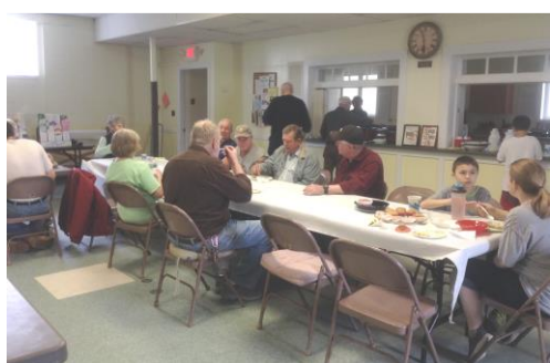
And to the Community Outreach Group for providing lunch!